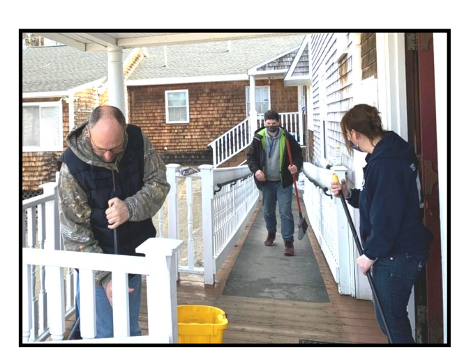
Starting outside spring cleaning early!