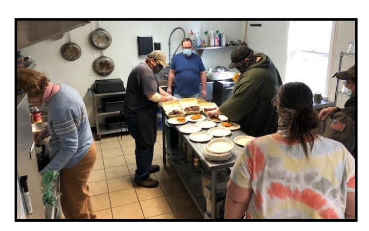
The kitchen crew hard at working preparing lunch.