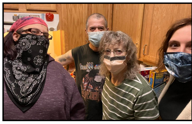
Mobile Reachout for our amazing members unable to attend.